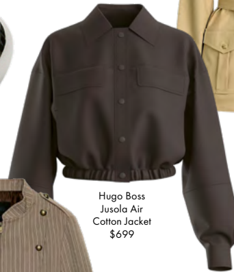
Hugo Boss Jusola Air Cotton Jacket $699