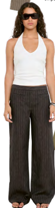
Bec + Bridge Zuri Straight Leg Pant $300

Utility dressing softens this season, with relaxed silhouettes and elevated leather pieces. Biker jackets, bombers, and polished layers bring a modern, confident edge to workwear that transitions seamlessly into the weekend.