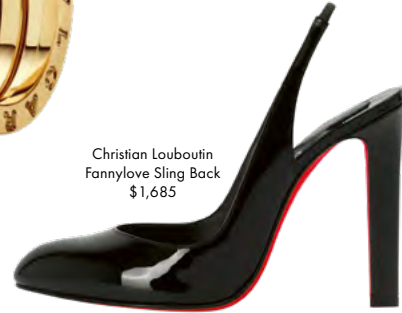
Christian Louboutin Fannylove Sling Back $1,685