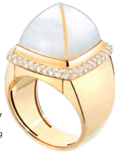
Fred White Mother of Pearl Pain De Sucre Ring $22,840