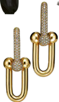
Tiffany & Co. HardWear Large Link Earrings in 18k Yellow Gold with Pavé Diamonds $32,000