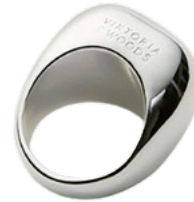
Viktoria & Woods Teardrop Ring $90