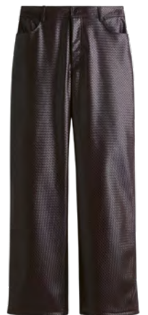
H&M Coated Pants $69.99