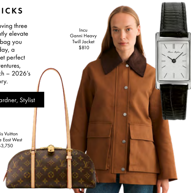
David Jones Heaven Mayhem Carino Watch $360