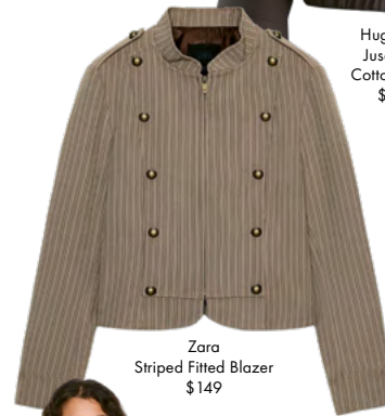
Zara Striped Fitted Blazer $149