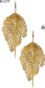
Carla Zampatti Gold Leaf Small Earrings $229

A+ style meets loud luxury this season. Pacific Fair delivers a curated edit of coveted pieces, including statement accessories that elevate everyday dressing with polished, modern ease.