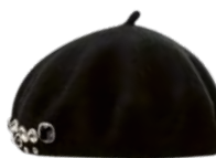
David Jones The Two Mrs Grenvilles Beret with Stone Detailing $59.95

Hats are huge in 2026. The beret returns as the ultimate finishing touch, adding polish and a hint of Parisian attitude.