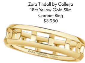
Zara Tindall by Calleija 18ct Yellow Gold Slim Coronet Ring $3,980