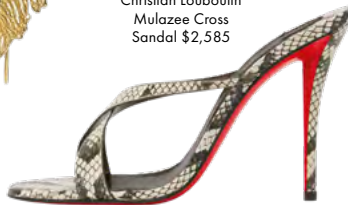
Christian Louboutin Mulazee Cross Sandal $2,585

A+ style meets loud luxury this season. Pacific Fair delivers a curated edit of coveted pieces, including statement accessories that elevate everyday dressing with polished, modern ease.