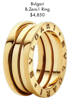
Bvlgari B.Zero1 Ring $4,850