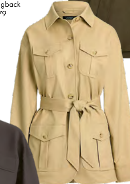
Ralph Lauren Double-Faced Stretch Cotton Field Jacket $559