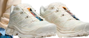
Stylerunner Salomon XT-6 Vanilla Ice/Almond Milk $300

Sport meets polish in one of 2026's most wearable moods. Think varsity knits, retro sneakers, and quilted layers styled with effortless, off-duty ease.