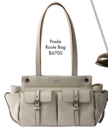
Prada Route Bag $6700