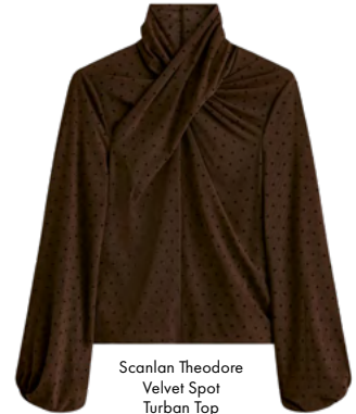
Scanlan Theodore Velvet Spot Turban Top $500

Pattern steps up this season. Leopard, checks, and graphic prints bring confidence to everyday dressing, whether statement or layered. Prefer subtle? Let accessories lead, from croc bags to animal shoes.