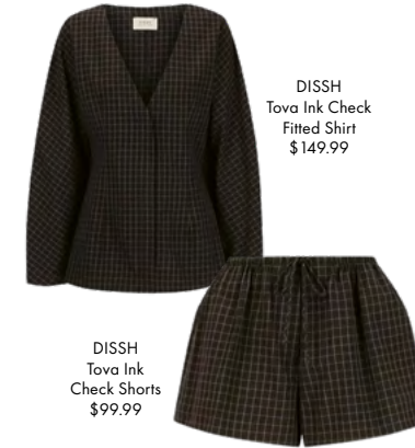
DISSH Tova Ink Check Fitted Shirt $149.99