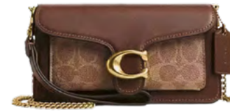
Coach Tabby Chain Crossbody Bag 19 In Signature Canvas $450