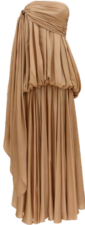
Zimmermann Alchemy Billow Maxi Dress $2,750