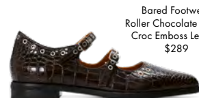
Bared Footwear Roller Chocolate Brown Croc Emboss Leather $289