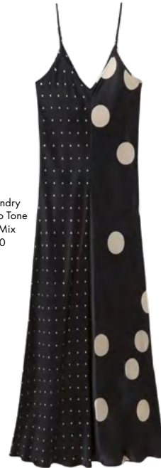
Silk Laundry Dress Two Tone Polka Mix $520