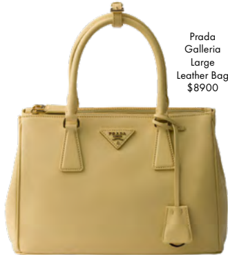
Prada Galleria Large Leather Bag $8900