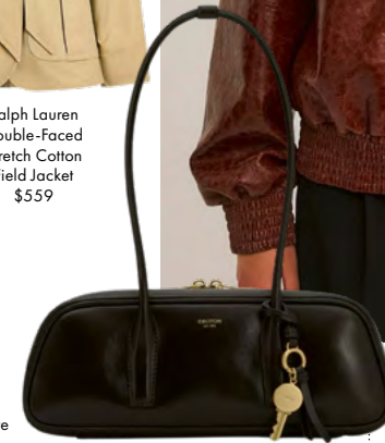
Oroton Louisa Shoulder Bag Crackle Dark Chocolate $449

Utility dressing softens this season, with relaxed silhouettes and elevated leather pieces. Biker jackets, bombers, and polished layers bring a modern, confident edge to workwear that transitions seamlessly into the weekend.