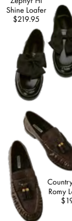
Country Road Romy Loafers $199

Loafer or ballet? No rivalry here. Each holds its own in the modern wardrobe, shifting with mood, moment, and the day's ensemble.