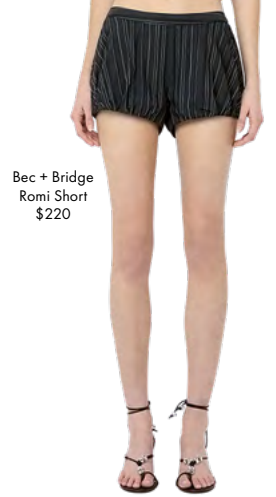
Bec + Bridge Romi Short $220