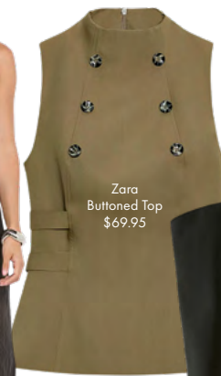
Zara Buttoned Top $69.95