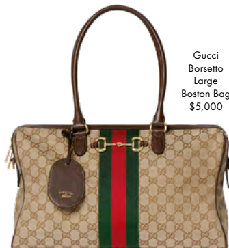
Gucci Borsetto Large Boston Bag $5,000