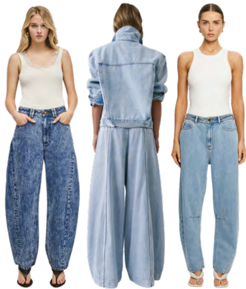
From left to right: David Jones Aje Stevie Barrel Ankle Jean in Blue Rinse $299 Decjuba Paloma Extreme Balloon Jean in Alaska Blue $119.95 Kivari Dylan Jean in Pale Stone $249