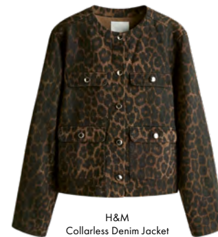
H&M Collarless Denim Jacket $59.99