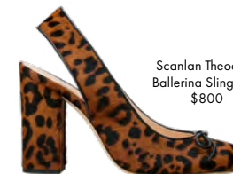
Scanlan Theodore Ballerina Slingback $800