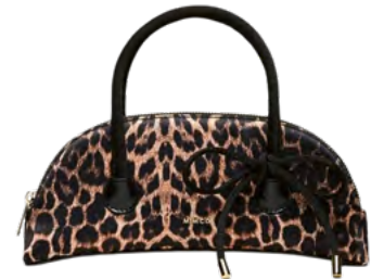
Mimco Jardin Grab Bag $179.95