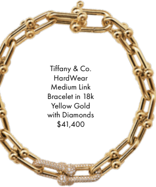
Tiffany & Co. HardWear Medium Link Bracelet in 18k Yellow Gold with Diamonds $41,400