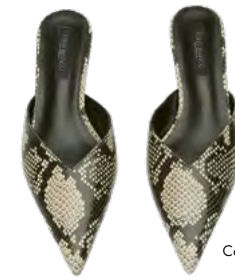
Tony Bianco Connie Ecru Snake $199.95