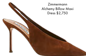
David Jones Aquazurra Voltaire Sling $1,500