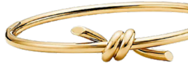
Tiffany & Co. Knot Wire Bangle in 18k Yellow Gold $8,600