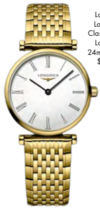
Longines La Grand Classique De Longines 24mm Watch $2,375