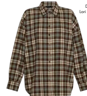
DECUJBA Lori Flannel Shirt $74.96

Pattern steps up this season. Leopard, checks, and graphic prints bring confidence to everyday dressing, whether statement or layered. Prefer subtle? Let accessories lead, from croc bags to animal shoes.